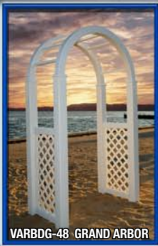
VARBDG-48 GRAND ARBOR